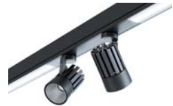
Spot- and Linear Luminaires