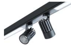
Spot- and Linear Luminaires